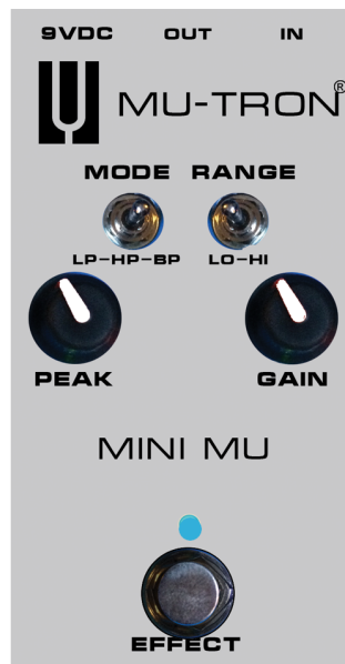
Funky Rhythm Quack